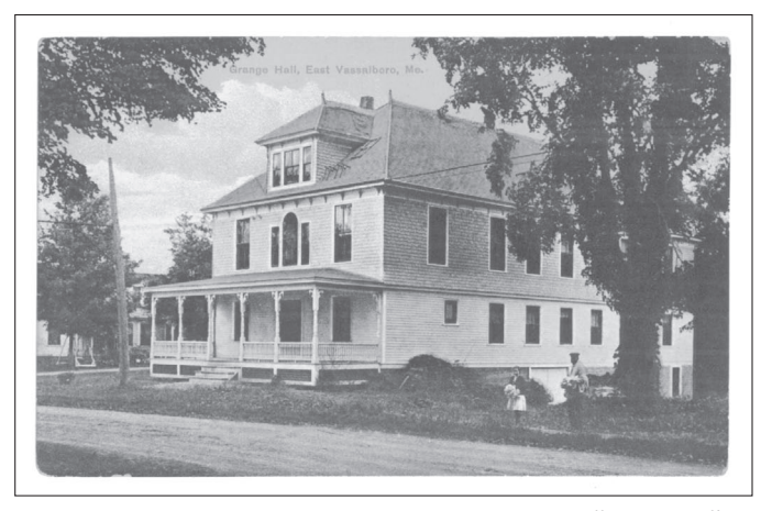
Grange Hall, East Vassalboro

This year brought continued activity dealing with new and old subdivisions. Three new subdivisions were approved: On Route 201, four lots in Riverside Heights, on the south end of the Church Hill Rd, five lots with duplexes on the lots, and on the Stone Road, 12 lots were approved. We also re examined three approved subdivisions for amendments. One needed an amendment for a change in road construction, another wanted to add a lot, and the last wanted to add four lots. The first two were approved, the last was not due to issues with road construction.