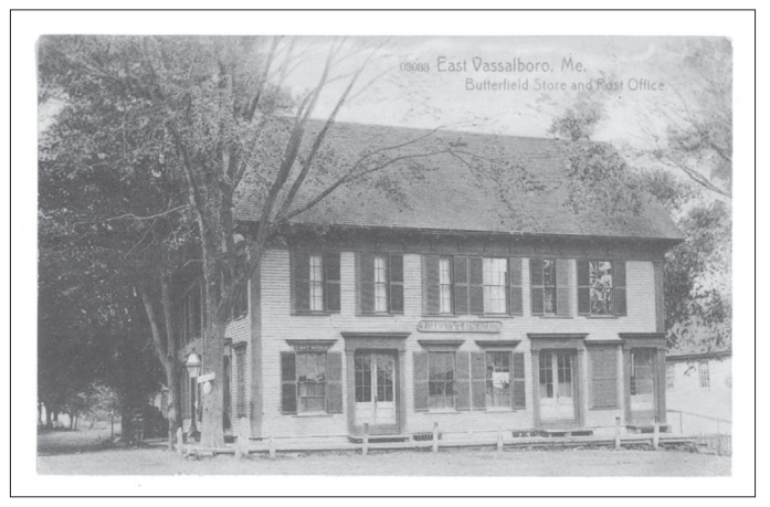
Butterfield Store and Post Office, East Vassalboro

Region Lakes Alliance – conservation assistance and shore line property maintenance. Also, this past year we have had Boat Launch monitors in place – paid for by our Association – to help insure that no evasive