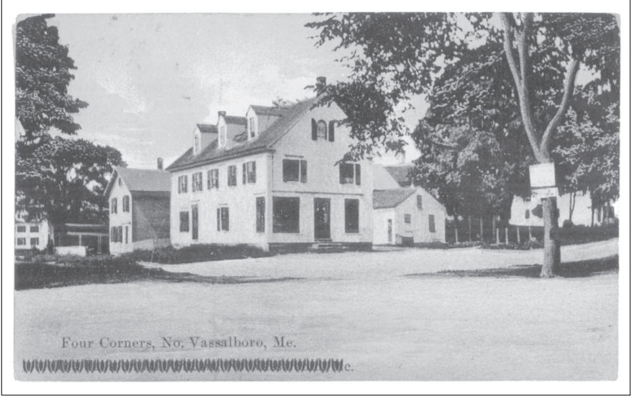
Four Corners, North Vassalboro