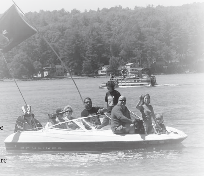
4th of July parade: photo courtesy of Rick Hayden