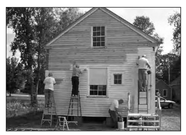
Annex repair day.