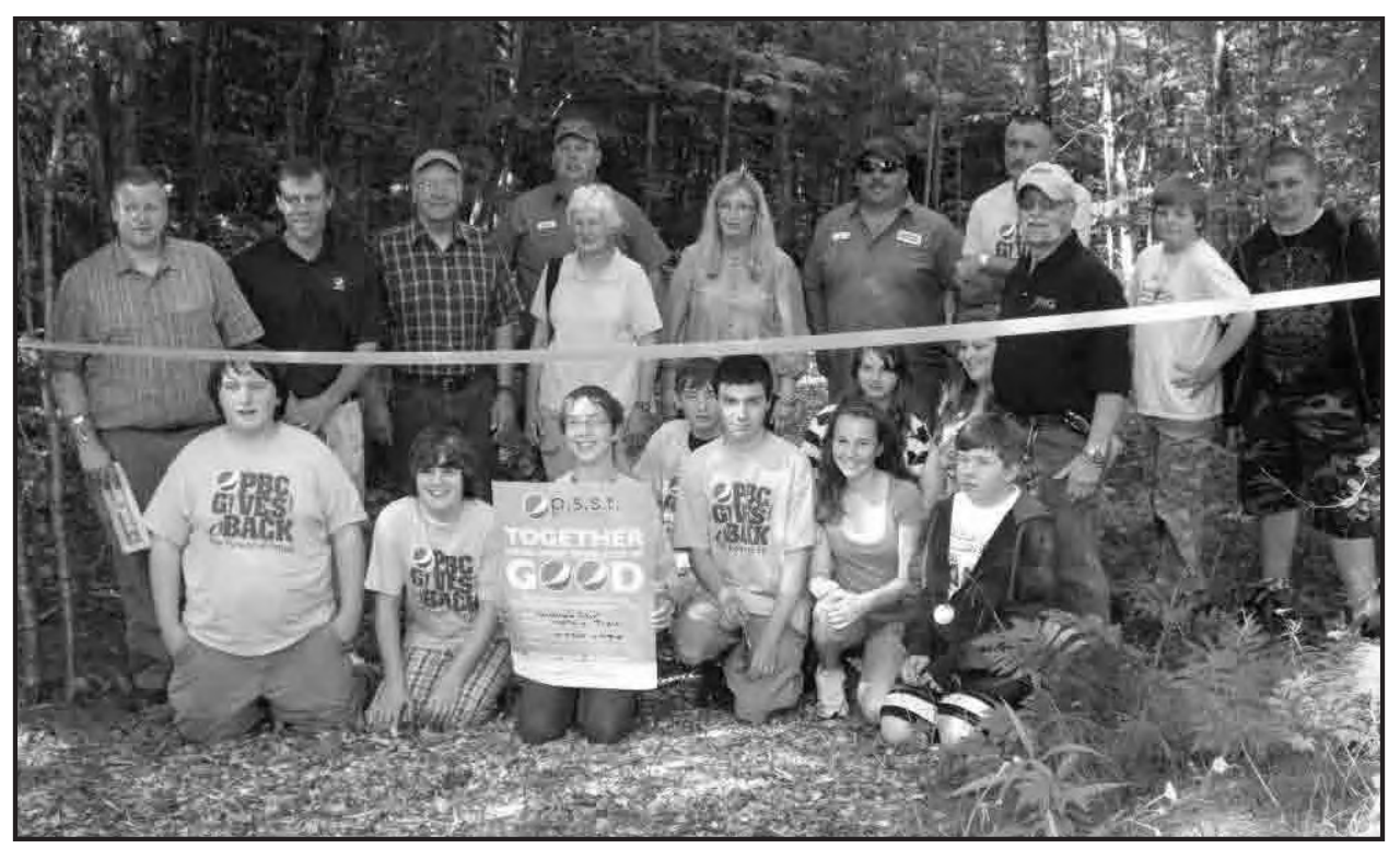
REACH students celebrate grand opening of school trail.

Vassalboro Community School has enjoyed another year of tremendous support from the community, parents and students. The successful completion or our mission statement and work with children would not be possible without the thousands of volunteer hours offered by the very talented and thoughtful people of this community. Thank you again for another year of working together for the benefit of our children.