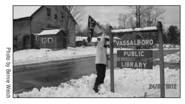
You're always welcome at the Vassalboro Public Library.

FY 10-11 was another engaging and exciting chapter in the history of the Vassalboro Public Library. Patronage continued to grow with over 200 new patrons (155 adults, 80 children) joining the library and our collection increased by nearly 1200 new items, including more than 1000 books and close to 200 audio books, videos, and DVDs. Over 7,500 patrons visited the library and materials circulation remained steady at nearly 12,500. Logging well over 1000 patron sign-ins, our 3 computers (PCs) with high-speed internet access and color printing, as well as our free Wi-Fi access also maintained popularity. Additionally, the reality of our online catalog and automated circulation is becoming more and more imminent due to outstanding volunteer efforts toward digitization. We continue to provide an ever-growing selection of new literature and bestselling fiction, award-winning and educational children's materials, current and noteworthy non-fiction, local history and genealogical materials, and both new and historic notable Maine works. As ever, many favorite items come from plentiful and much appreciated donations.