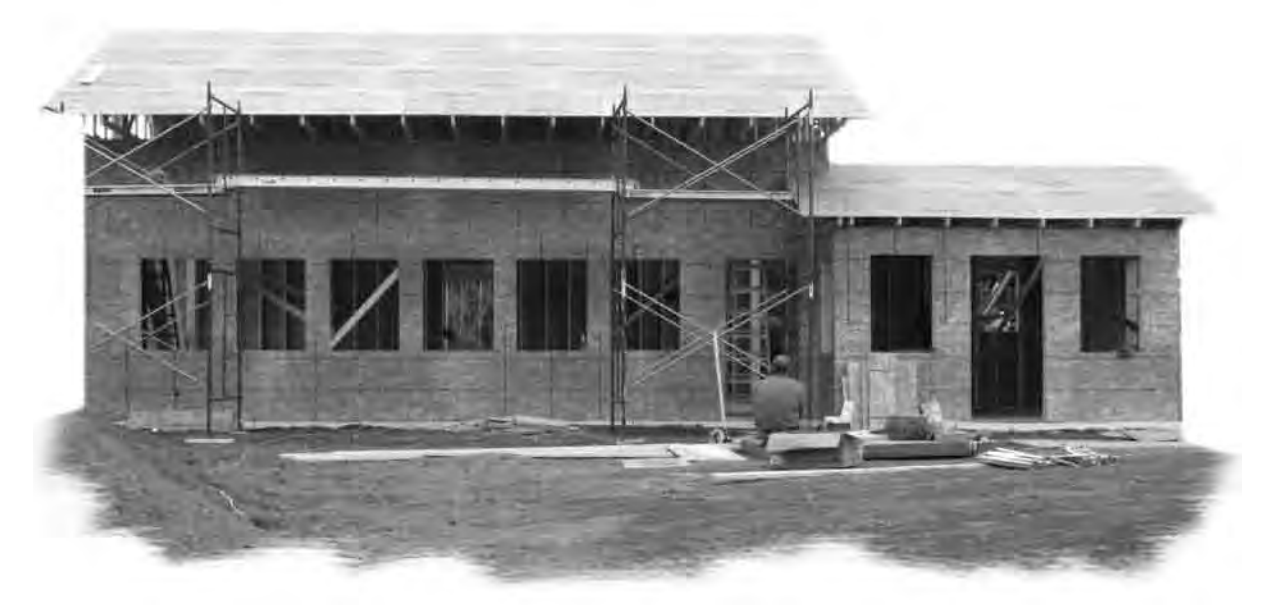
TOWN OF VASSALBORO / PAGE 18 / 2011 ANNUAL REPORT

In October, Vassalboro residents had the opportunity to participate in the Household Hazardous Waste collection day, hosted by KVCOG of Fairfield. This event offers a way to properly dispose of paints, stains, thinners, pesticides, and other household chemicals. When disposed of improperly, these items can get mixed in the trash and