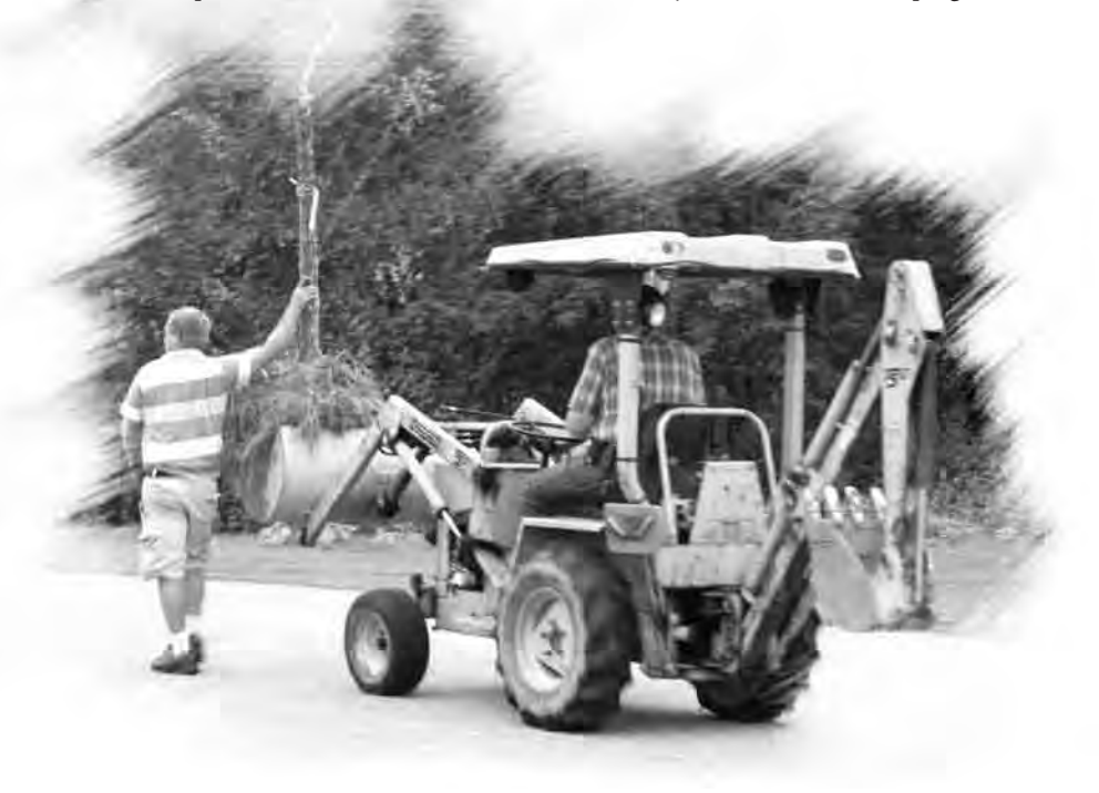
TOWN OF VASSALBORO / PAGE 30 / 2011 ANNUAL REPORT

Our winter activity has been comprised of organizing meetings with our legislative representatives in order to share our concerns, listen, and learn about the bills that are pending in the Legislature. We will continue to develop an inventory of Vassalboro's natural resources in the spring and invite anyone interested in helping to contact us.