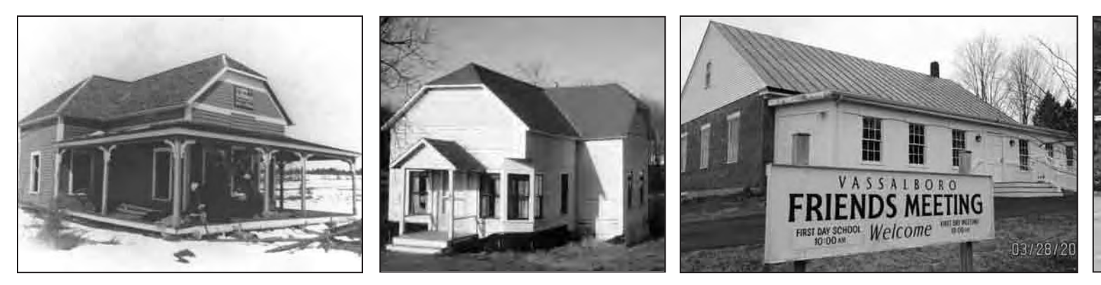
The Vassalboro Public Library, 1912 to 1979

In the fall of 1974, a young mother walked her baby in his carriage down Stanley Hill Road. They were new to East Vassalboro, but she had discovered a tiny library less than a mile from home, and was eager to explore it. As she entered the dark, shadowy building, she knew nothing about its past or its future.